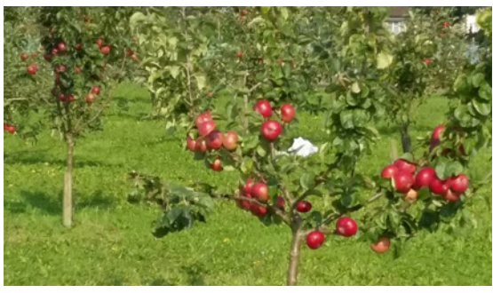
Tom Putt Cider Apples

We have had several varieties of plums ripen but in very small quantities but at least they are fruiting. The pears have a small crop but as always the difficulty is knowing when to pick them before they are ripe as they go from ripe to rot in a very short space of time!