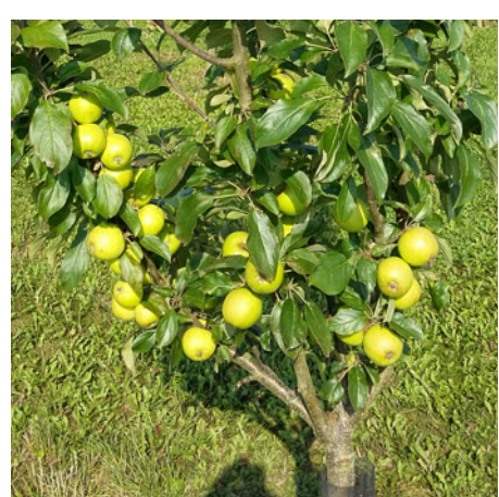
Michelin Cider Apples

The apples are the stars this year with bumper crops of various varieties. We have picked the early ripeners like Discovery, Worcester Pearmain, Ellison's Orange and Merton Worcester and even some of the cider apples are ripe and ready to gather in about a month early. We have many varieties that you won't see in the shops or even in gardens these days so it is lovely to find new tastes.